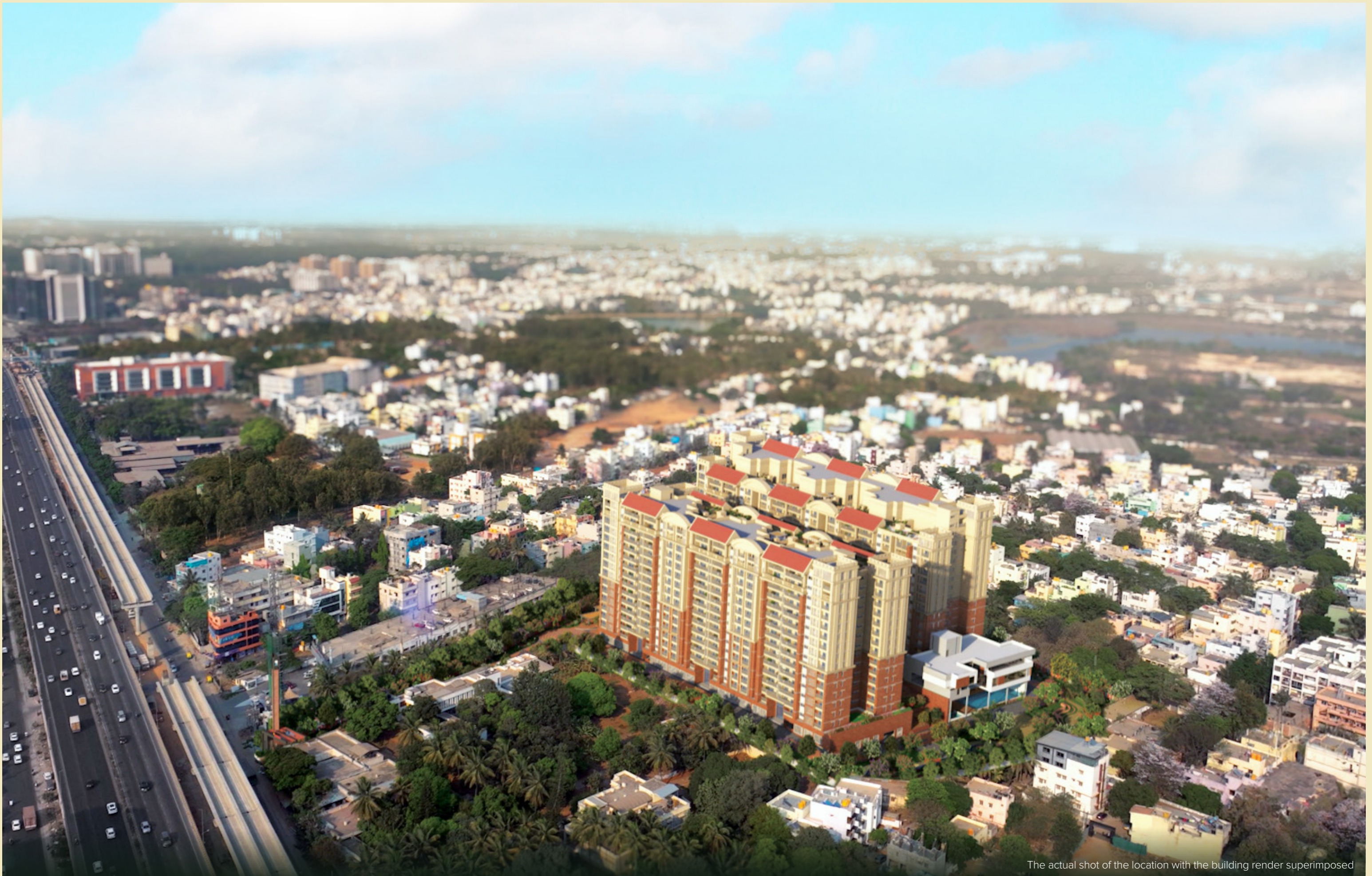
The actual shot of the location with the building render superimposed

The information depicted herein viz., master plans, floor plans, furniture layout, fittings, illustrations, specifications, designs, dimensions, rendered views, colours, amenities and facilities etc., are subject to change without notifications as may be required by the relevant authorities or the developer's architect, and cannot form part of an offer or contract. Whilst every care is taken in providing this information, the Developer cannot be held liable for variations. All illustrations and pictures are artist's impression only. The information are subject to variations, additions, deletions, substitutions and modifications as may be recommended by the company's architect and/or the relevant approving authorities. The Developer is wholly exempt from any liability on account of any claim in this regard. (1 square metre = 10.764 square feet). E & OE. All dimensions and calculations are done in metric system (M/Sq.m), and imperial system (Ft/Sq.ft) shown is for reference only. All dimensions indicated in the drawing are from unfinished surfaces, excluding plaster thickness and tile thickness.